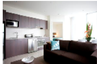
Spacious Living Areas