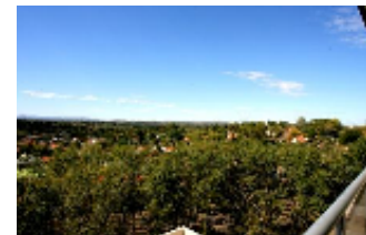
Quiet & Leafy Location